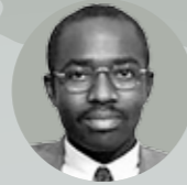
Dr. Hippolyte Fofack

Minister for International Development, United Kingdom (subject to General Election)